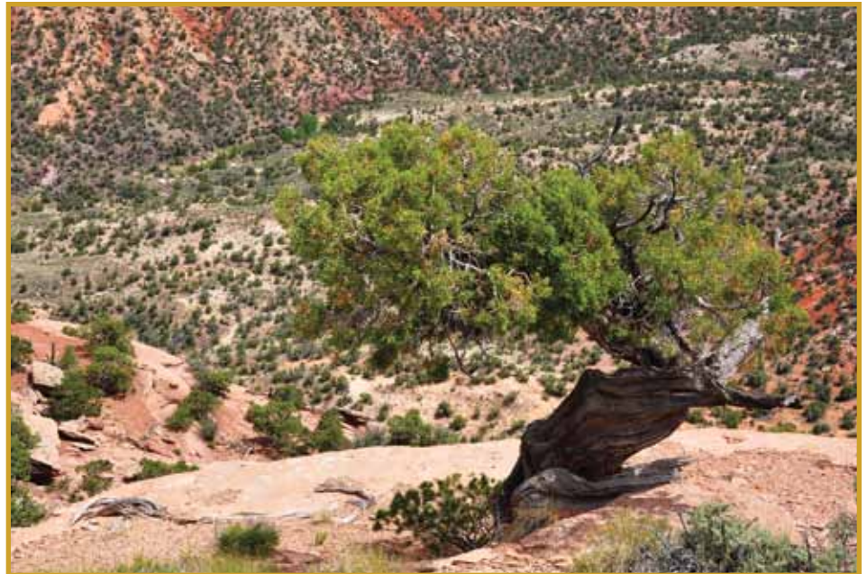
Figure 11: A juniper tree in the Colorado National Monument.

For more information or professional assistance in managing your forest, contact your local Colorado State Forest Service district office.