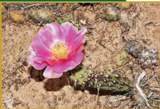
Figure 4: Prickly pear cactus is a common plant in piñon-juniper forests.

A variety of techniques may be used to manage piñon-juniper forests. Silvicultural prescriptions based on thinning focus on “de-stagnating” dense stands. This helps achieve woodland stand improvement and a healthy balance among overstory trees, young trees and other vegetation. Thinning a forest to a target density and having proper diameter distribution also improves the health and vigor of individual trees and promotes regeneration of forest tree species. A healthy, vigorous tree is less susceptible to insect infestation and pathogen infection and is better able to withstand wildfire – a natural, ecological process in piñon-juniper ecosystems.