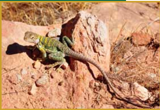
Figure 3: Collared lizards can be found warming their bodies on rocks and boulders in piñon-juniper habitat.

Form and growth habit of piñon and juniper limit their use as post and pole material. Because of their resistance to decay, junipers are a preferred species for posts and poles. Other uses of juniper include landscape timbers, ornamental materials, firewood and wood-plastic composites for roofing. Piñon pine woody material uses include pellets, firewood, animal litter and miscellaneous materials such as laminated veneer. Piñon pine also is known for growing and yielding edible, highly-valued piñon nuts.