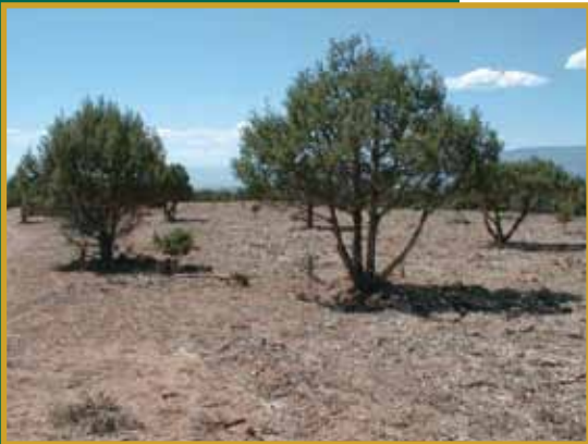
Figure 9: A completed management project in a piñon-juniper forest.

Survivability of piñon and juniper as a result of prescribed burning depends on spatial arrangement across the landscape, overstory density where forest types intertwine, fuel loads of herbaceous understory and individual crown density. Broadcast prescribed burning is best conducted when combined with uneven-aged thinning treatments. The combination of burning and thinning provides better long-term benefits than burning alone. This is due to the reduction of crown-bulk density, which influences potential crowning fire behavior. Fire helps stimulate new growth of the herbaceous understory, including grasses and low shrubs, which increases browsing opportunities for wildlife. A low-intensity fire may increase the size and age class diversity of the piñon and juniper. Fire also may be used to address slash piles in fall, winter and early spring when favorable conditions are present.