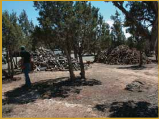
Figure 8: Slash piles from Rocky Mountain juniper trees.

late fall and winter months (the dormant season) to avoid attracting Ips beetles. If thinning and pruning occurs in the spring and/or summer, it is important to properly dispose of slash within three weeks. This is to prevent a generation of Ips from infesting slash piles and producing offspring that may infest healthy trees. Slash that is chipped in spring or summer should not be placed or piled near the base of standing trees because it may attract Ips. Slash piles created in winter or fall may be retained for small mammal habitat.