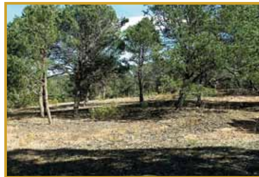
Figure 7: Chipping slash from a piñon-juniper management project.

To achieve the desired spacing, thin the trees so that, on average, tips of individual tree limbs do not touch their neighbors, or allow for a minimum five feet of space between tree crowns. Spacing reduces competition and allows remaining trees space to grow. Random clumps of trees may be left and occasional larger openings created for greater forest diversity.