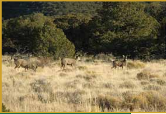
Figure 2: Mule deer are commonly found in piñon-juniper forests.

Juniper dominated woodlands tend to include open savannahs of scattered trees with significant shrub cover, except in areas where sagebrush has become dominant. Scattered openings and shelter from remaining trees help sustain healthy populations of understory grasses, shrubs and forbs. Due to the lack of natural disturbances and proactive forest management, tree densities have increased to a level that will support damaging crown fires.