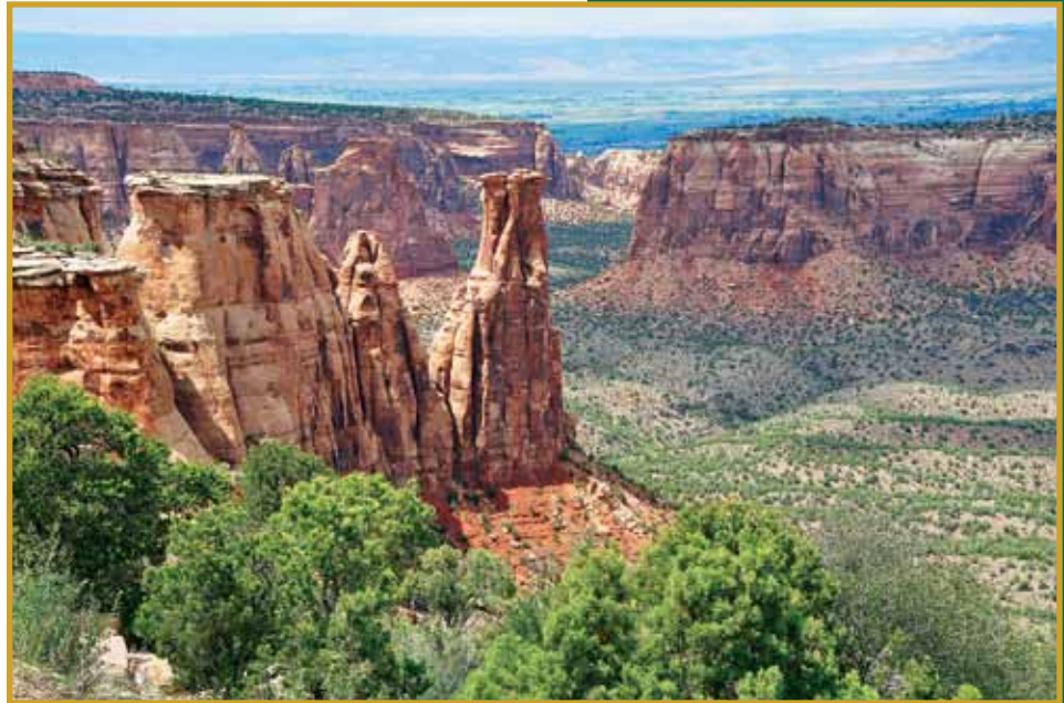
Figure 1: Piñon-juniper woodlands are the dominant vegetation type in the Colorado National Monument.

Piñon-juniper typically grows on harsh sites. Annual precipitation ranges from 10 to 15 inches per year in these woodlands. Both piñon and juniper species have developed resistance to drought and cold. This promotes preferred open canopy structure and encourages regeneration so that new trees are ready to replace the more mature and dying trees. Piñon-juniper reproduction occurs through natural seed dissemination and germination. Good seed crops may only occur every two to five years. Both tree types are shade-tolerant below a height of 12 inches. When the height is greater than 12 inches, full sun is required to promote further growth.