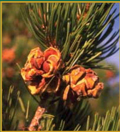
Figure 6: Characteristics of piñon include: